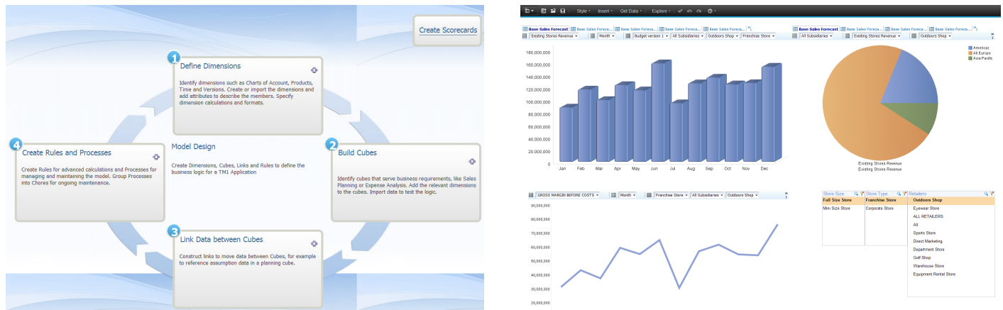
Figure 2: Cognos Express is a powerful, easy to use budgeting and planning environment that is accessible on both your desktop and on mobile devices.

Cognos Express helps guide the performance management process by enabling finance and line-of-business managers to assign functional responsibility to individuals or groups. Contributors submit data according to schedule, and tasks are designated as not started, in progress, approved, rejected or not delegated. Reviewers monitor progress and accept or reject contributions as needed. Cognos Express makes the entire performance management process highly visible and helps enhance timeliness and accountability.